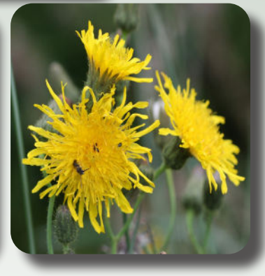
Under the Alberta Weed Control Act, Perennial Sow Thistle must be controlled.

Perennial Sow Thistle is a perennial plant that reproduces by both seed and rhizomes.