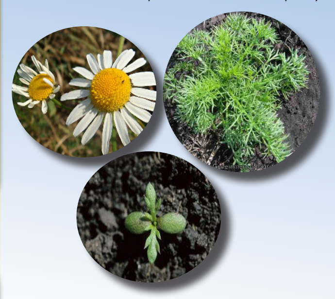
Under the Alberta Weed Control Act, Scentless Chamomile must be controlled.

Seeds: Seeds are tiny (~2 mm), ribbed and dark brown. Seeds develop and become viable quickly.