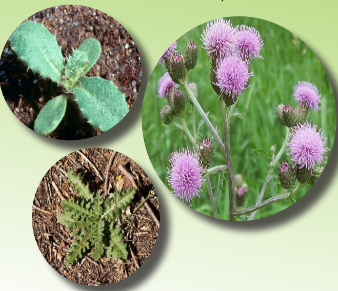
Under the Alberta Weed Control Act, Canada Thistle must be controlled.

Seeds: Borne in an achene 2-4 mm long which is tufted to aid in wind dispersal.